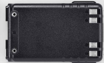
• Battery pack, BP-227