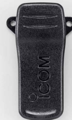
• Alligator-type belt clip, MB-98